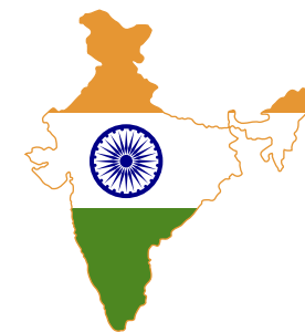
INDIA & SUBCONTINENT